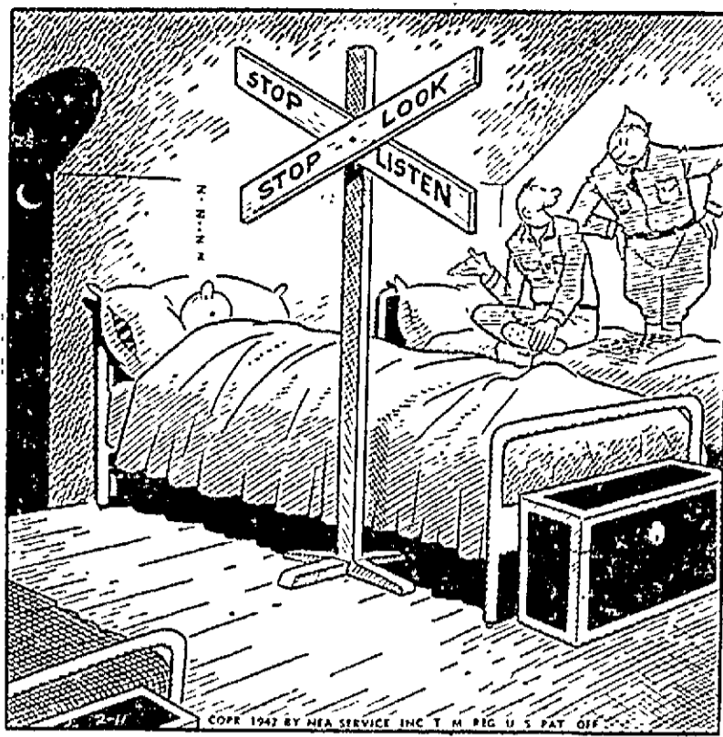
"The gang was always falling over his bed!"