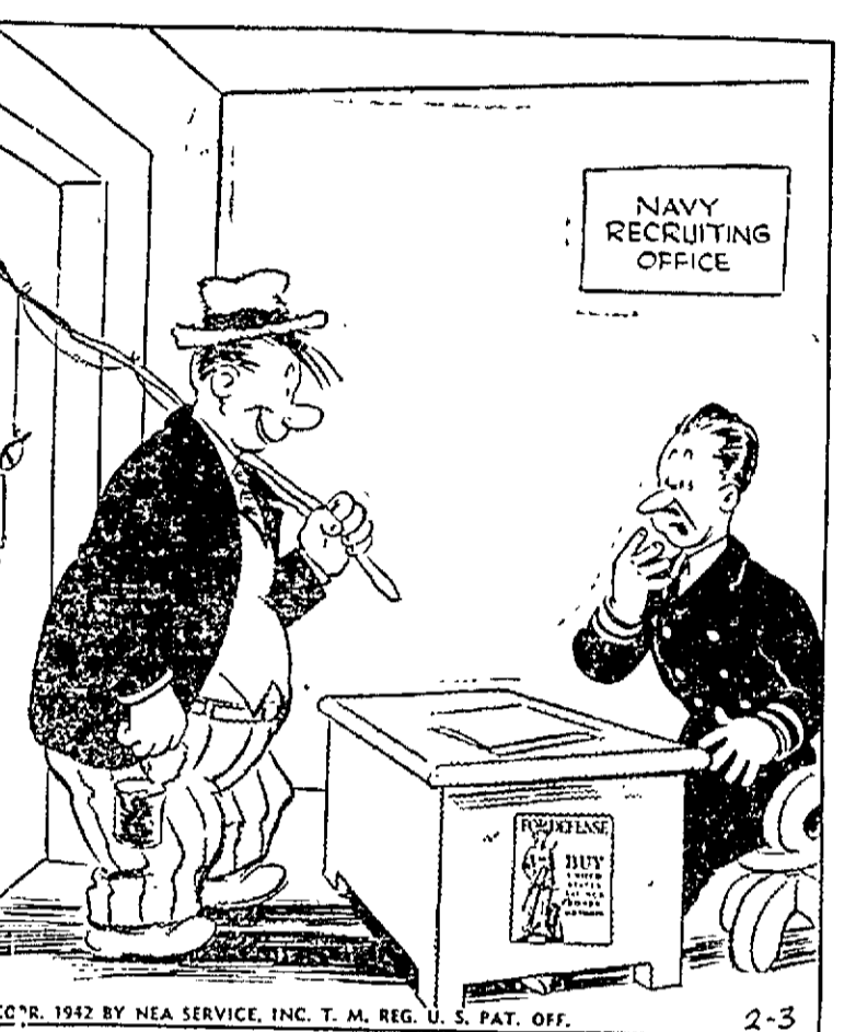
"I thought as long as I was enlisting in the Navy, it might come in handy on a dull day!"