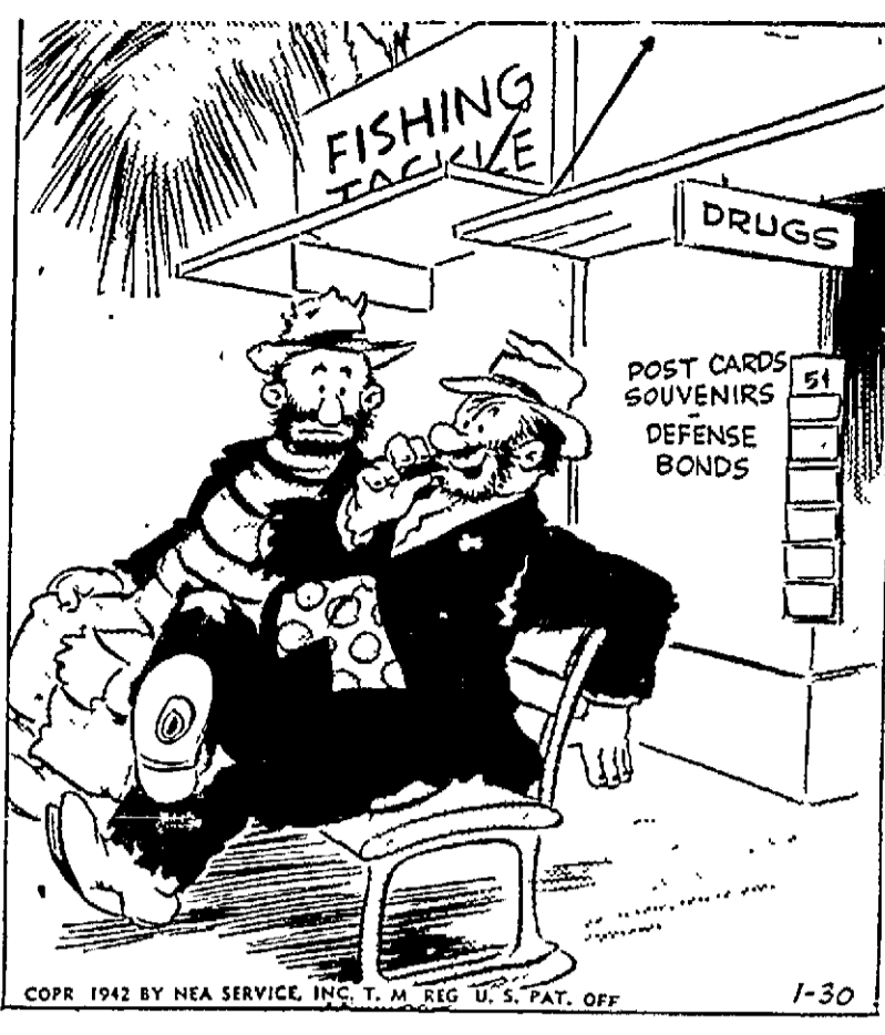
"I started out being a bum to get material for a book—but I liked it so well I gave up writing the book!"