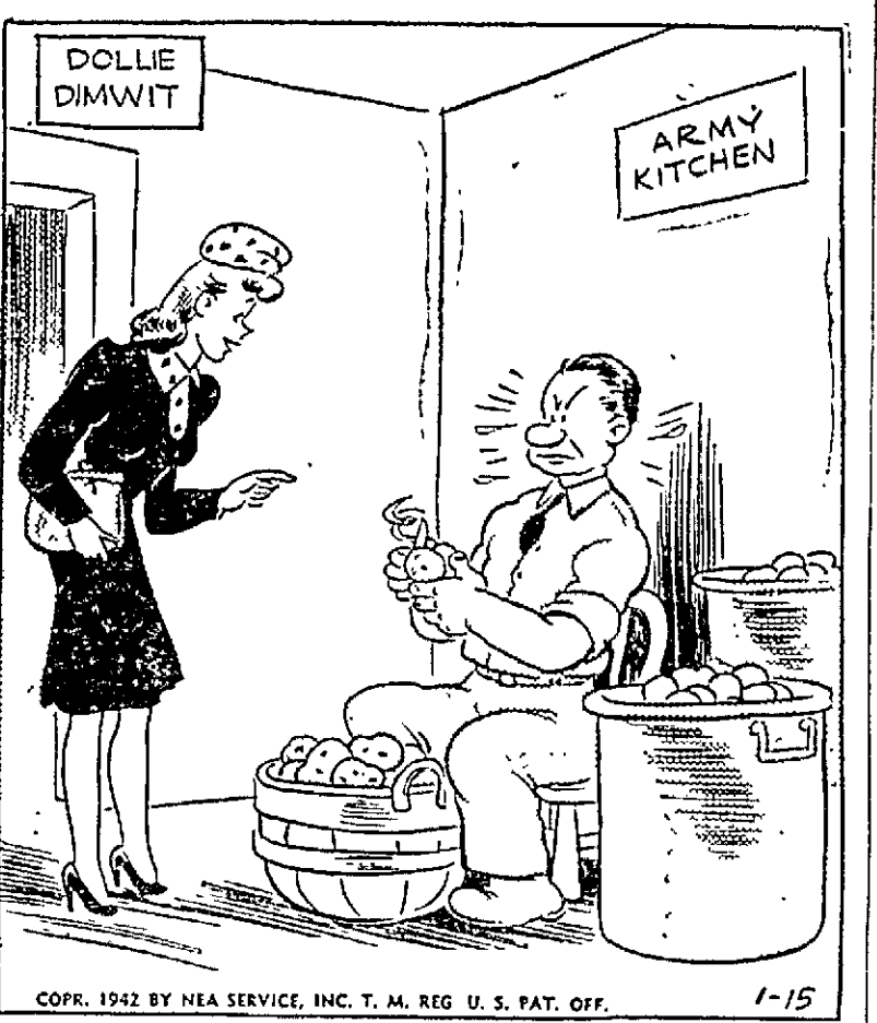
"Do you belong to those 'paratroops' I've been hearing so much about?"

Wild Bill Hickok comes riding into town. His old friend, Cannonball, a resident of Deadwood, tells him of the trouble they have been having and soon persuades Hickok to accept the job of marshal.