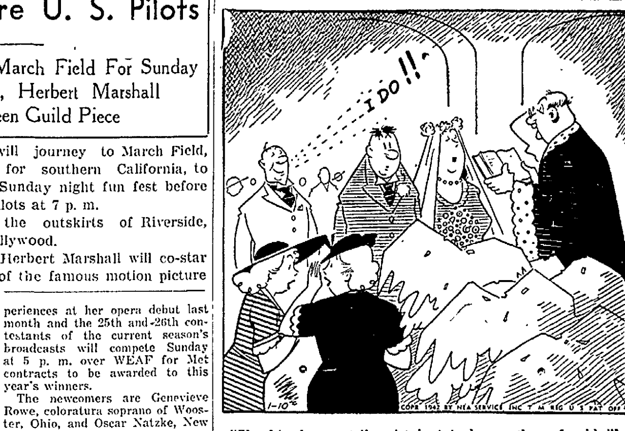
"She hired a ventriloquist just to be on the safe side!"