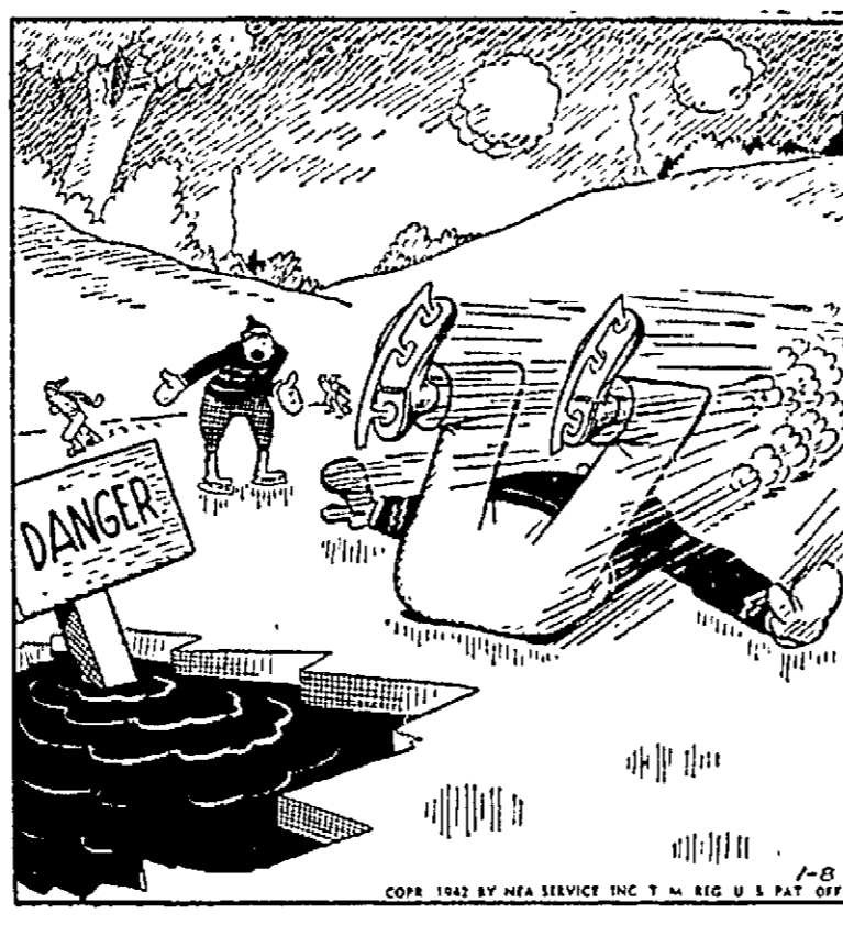
"Hey, you! Can't you read?"