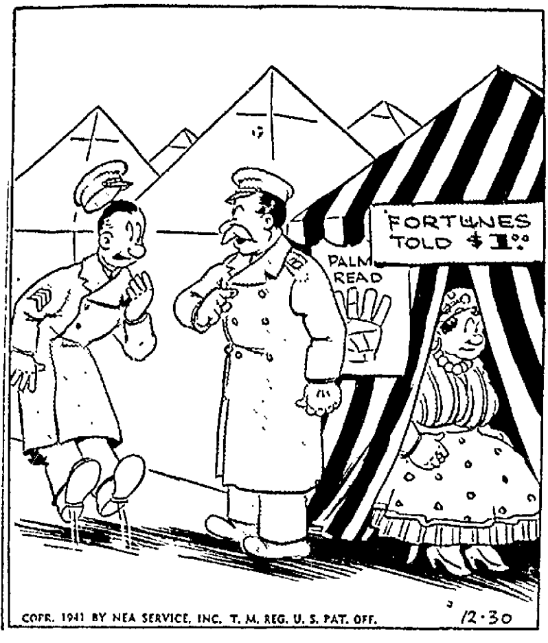
"How did she get there?"