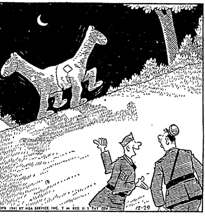
"That's so they can slip past the enemy sentry—he'll think he's having a nightmare!"

characters March and Miss Scott are portraying, had three children. The children grow up during the relating of the story, and naturally have to have playmates of the proper ages.