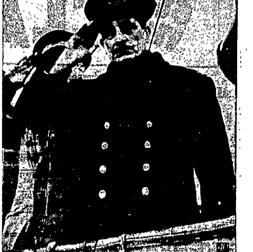
Vice Admiral Emile Muselier (above), who occupied St. Pierre-Miquelon islands of Newfoundland in the name of the Free French government, saluted as the crowd at St. Pierre sang La Marseillaise.

more timely reports may be obtained from the Division 1 department garage office, telephone 20811.