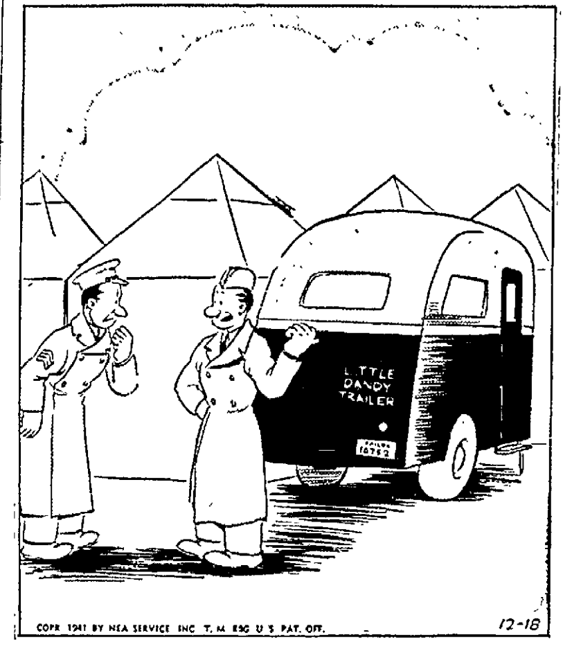
"Why should I live in a tent when I own that?"