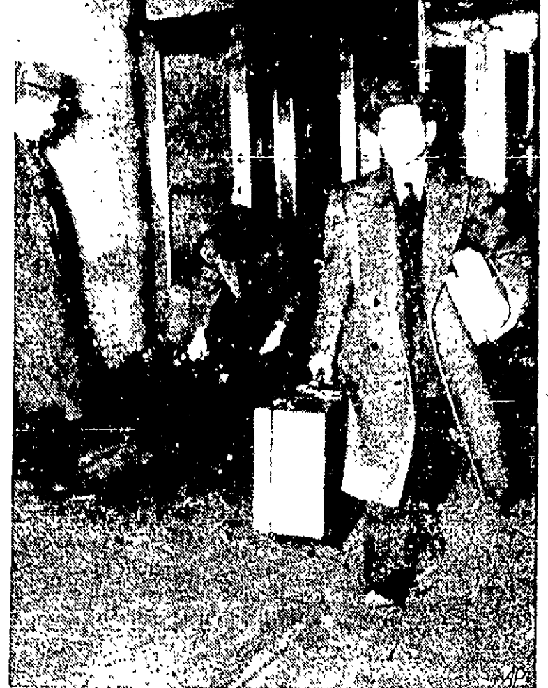
Staff members of the Japanese Consulate General leave their Fifth-ay offices in New York following President Roosevelt's announcement that Japanese warplanes had attacked Hawaii.