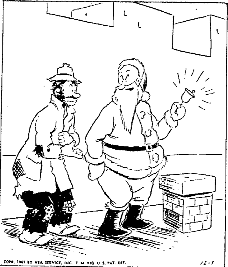
"Who do you think I am—Santa Claus?"

Charles, played by Powell, is forced to unavail.