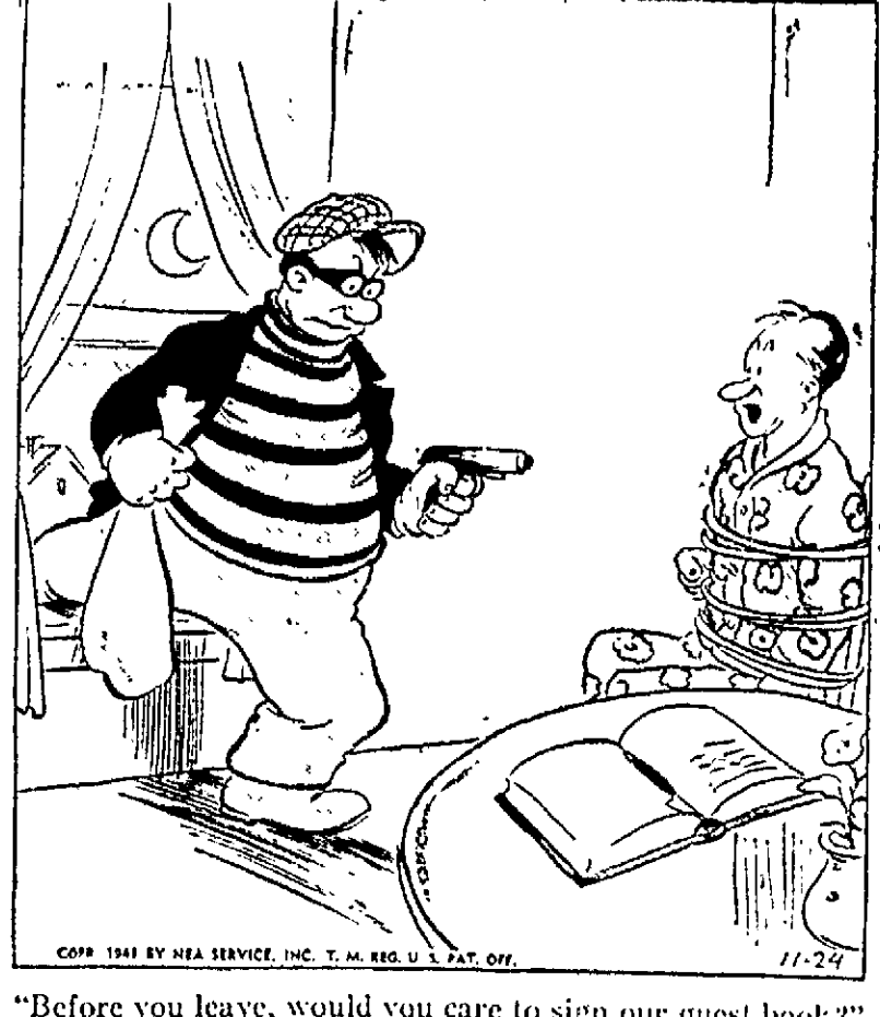
"Before you leave, would you care to sign our guest book?"