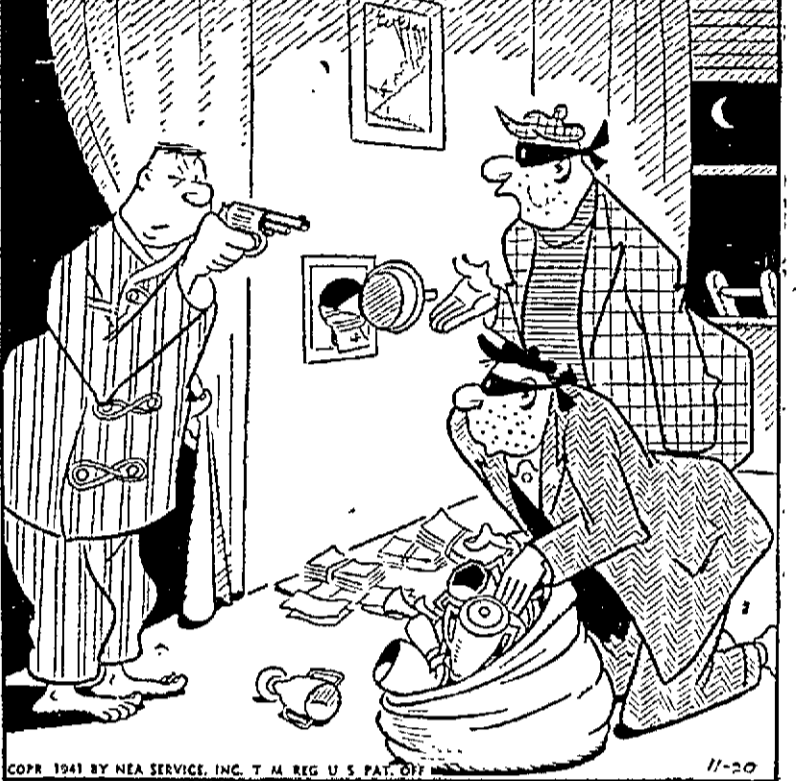
"We was just tryin' to help you collect a little somethin' on your burglar insurance."