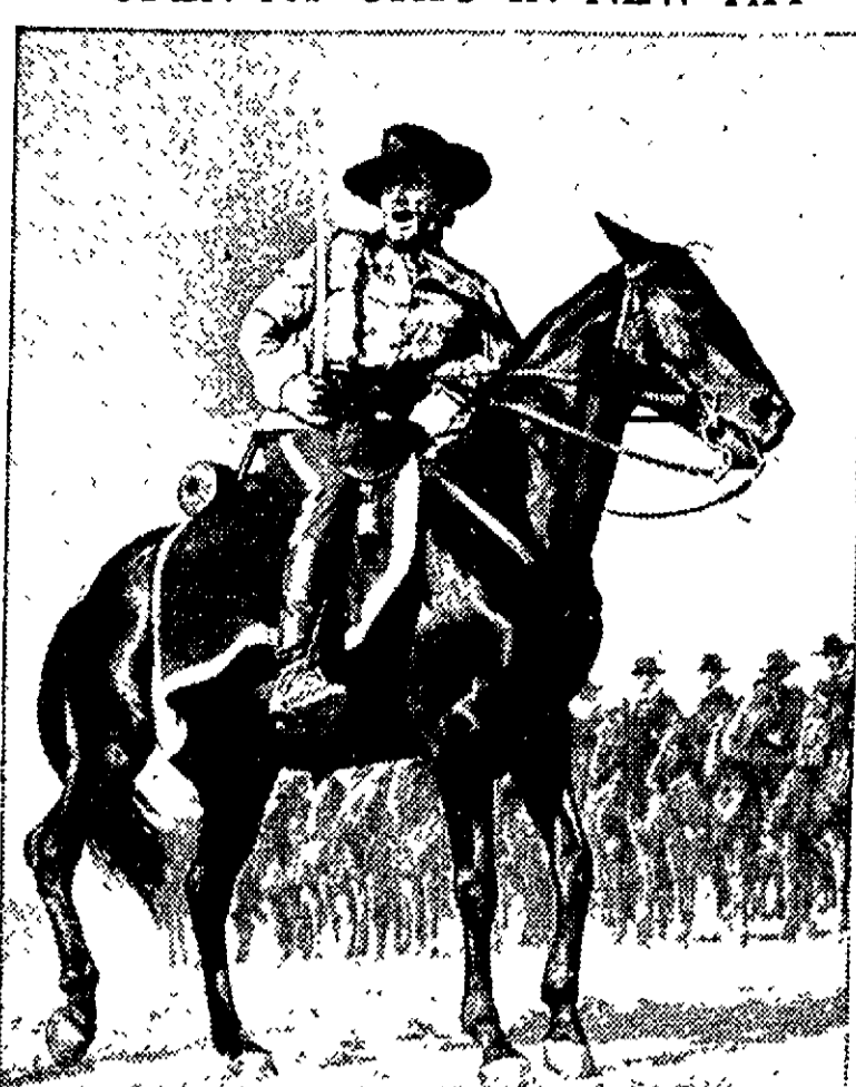
Errol Flynn has the role of General Custer in the historic film, "They Died With Their Boots On," a stirring story of post-Civil War days in the old west, commencing Thursday at the Ohio theatre.

or gangster, is seen in this picture in a strong dramatic role, and Miss Marsh is an excellent foil for him.