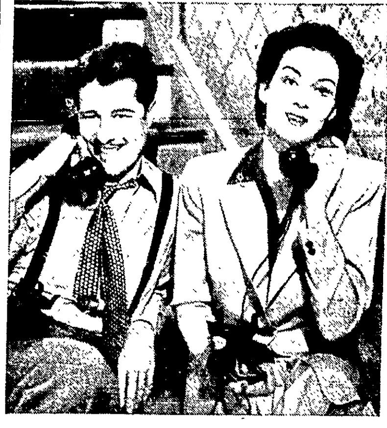
Don Ameche and Rosalind Russell appear in "The Feminine Touch," commencing Wednesday at the Ohio theatre.