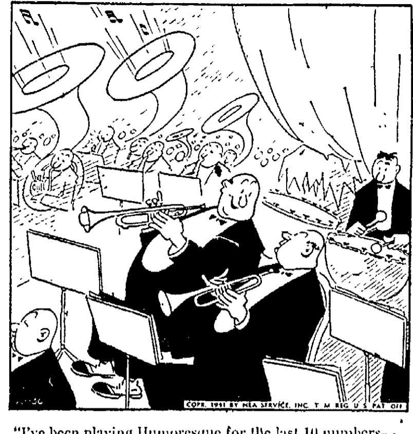
"I've been playing Humoresque for the last 10 numbers—I couldn't find my music!"