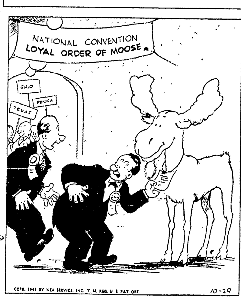
"The note says he's a delegate from Maine!"