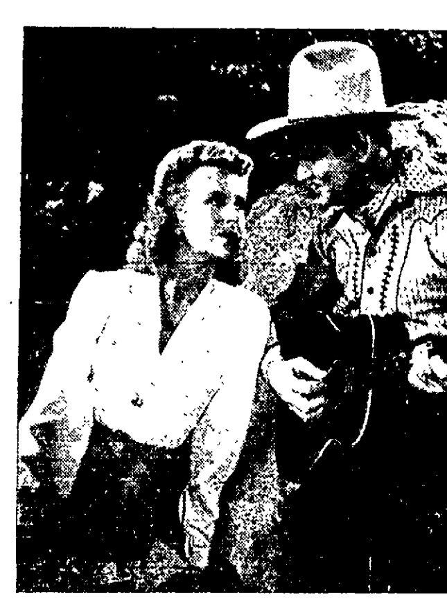
"Under Fiesta Stars," which starts Tuesday at the Lyric, feature Hollywood's favorite cowboy star, Gene Autry.