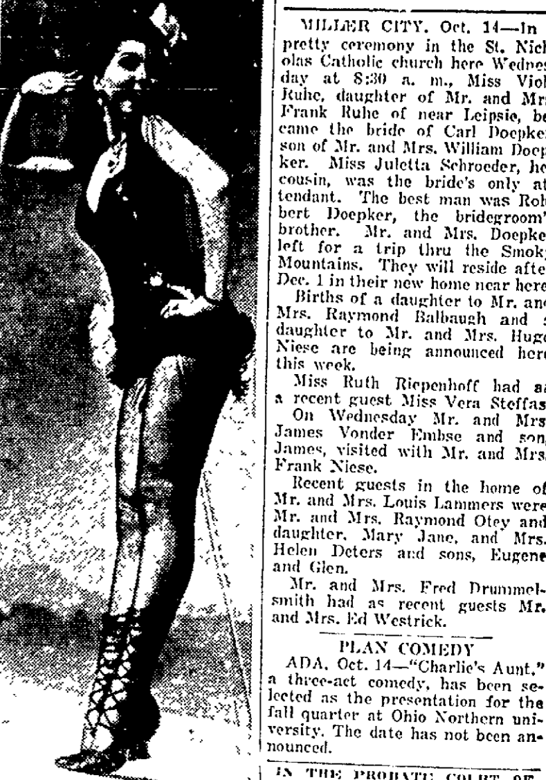
This naughty nineties outfit isn't coming back into style, but startler Ann Miller shows how nice it would look if it did. She's wearing the costume in a period picture.