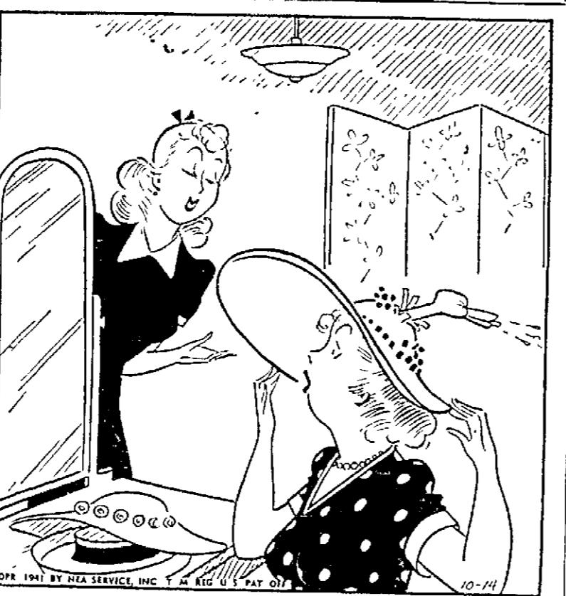
"This is our famous razzberry model—little Boppo pops up and hands out the razzberry every time you pass a duplicate!"