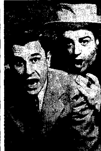
ABBOT AND COSTELLO