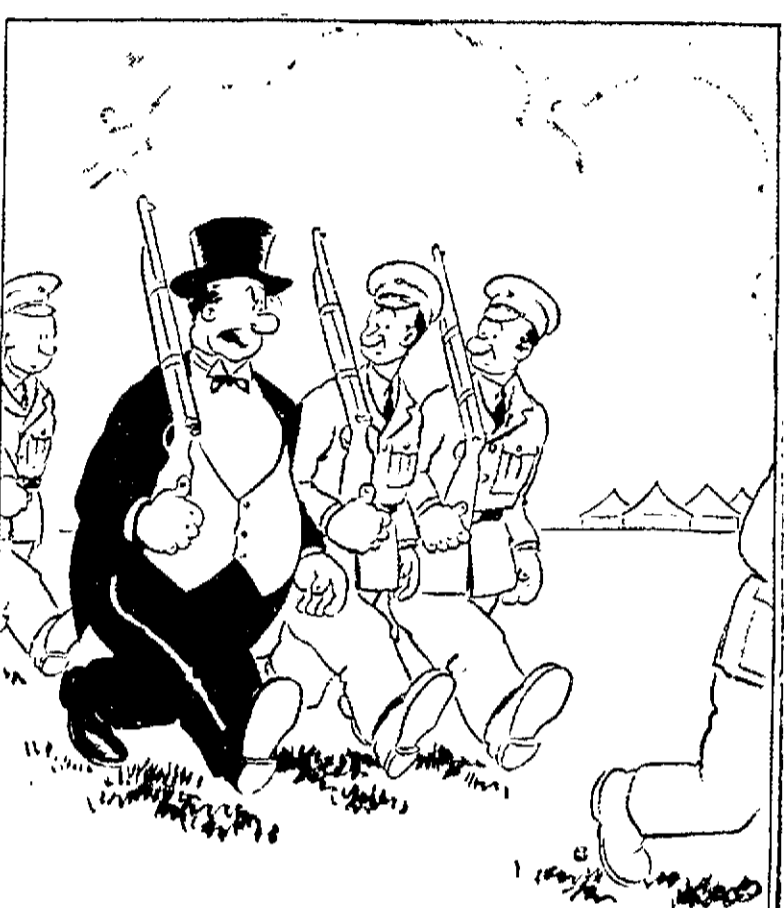
"Well, they said this was to be a 'dress parade,' didn't they?"

without sacrificing any of her appeal. On the contrary—her haunting beauty is enhanced as the sympathetic yet worldly-wise Jerry.