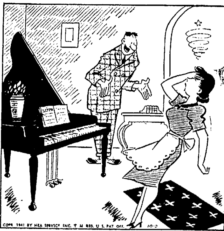
"Well, at least we made the first payment on the piano—I sold the bench!"