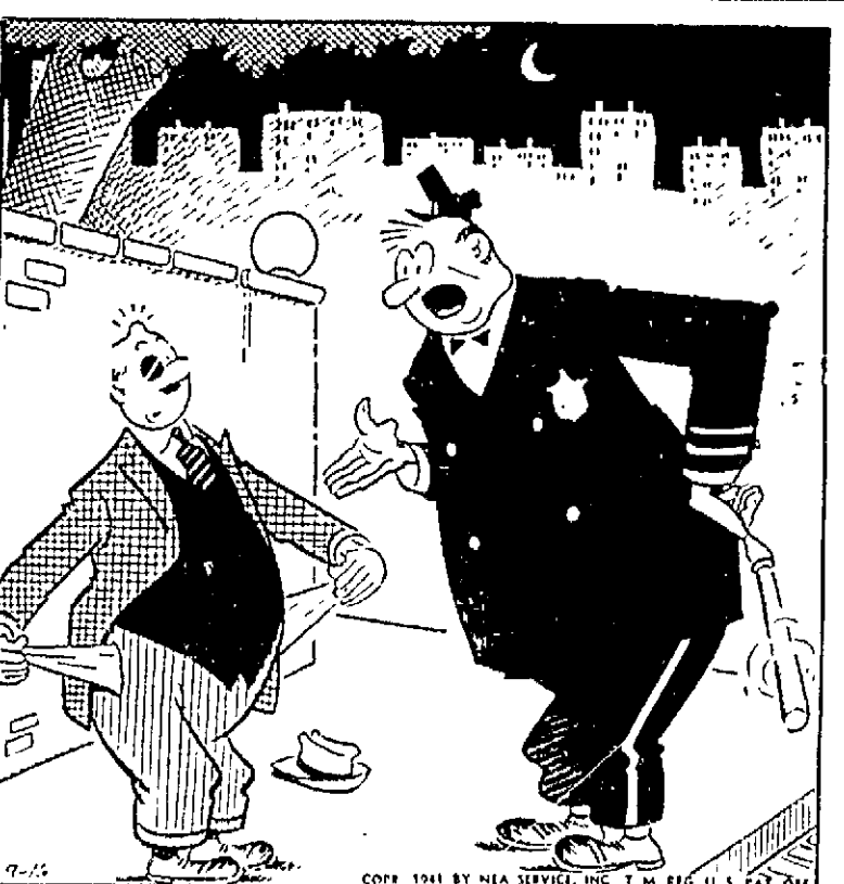
"Only one black eye and one lump, an' you let 'em rob you—you easy mark!"