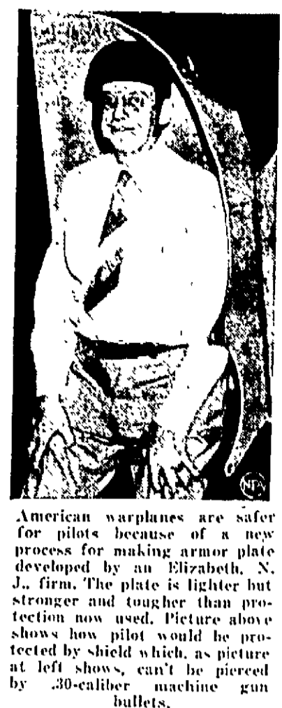
American warplanes are safer for pilots because of a new process for making armor plate developed by an Elizabeth, N. J., firm. The plate is lighter but stronger and tougher than protection now used. Picture above shows how pilot would be protected by shield which, as picture at left shows, can't be pierced by .30-caliber machine gun bullets.