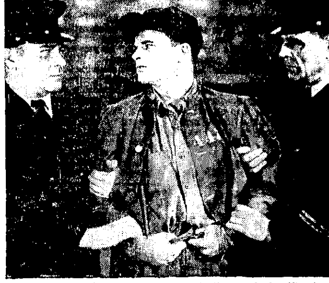
Robert Sterling is dragged away to the warden's office in a prison sequence from "The Get-Away," co-starring with "This Woman Is Mine" starring Franchot Tone, Walter Brennan, Carol Bruce and John Carroll, now playing at the Parkway theater.

Union Grove, Potosi, Waterloo Hearings Announced by State Hearing on the application of the Union Grove Telephone Co. for authority to revise its rates will be held in Madison Sept. 12 at 10 a. m., the public service commission announced today.