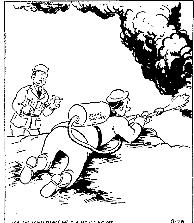
"Hey, Bud—got a match?"