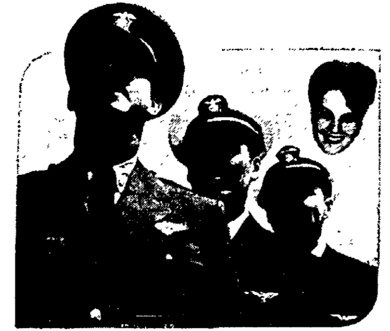
The color film, "Dive Bomber," Saturday at the Ohio theatre, starring Fred MacMurray, Errol Flynn and Ralph Bellamy, above, and introduces Miss Alexis Smith, insert.