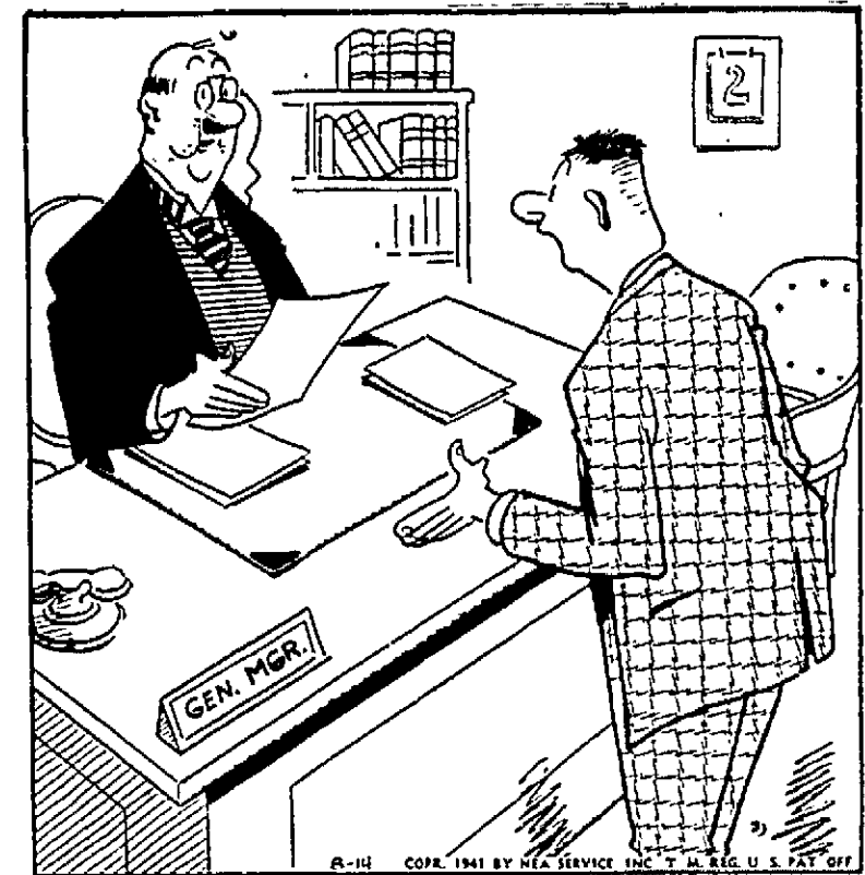
'Could I have my vacation extended another two weeks? My wife and I spent the first two arguing where to go!"