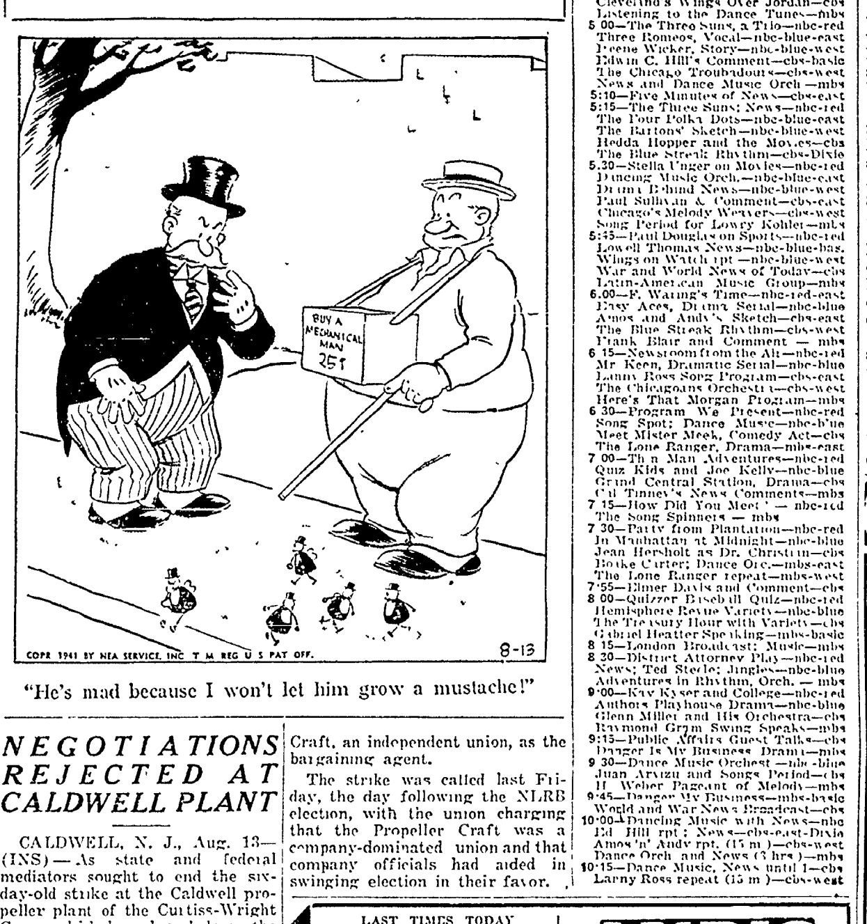
"He's mad because I won't let him grow a mustache!"