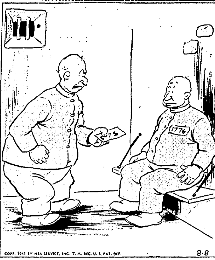
"It's not very pleasant living with a man who doesn't trust you enough to change a $7 bill!"