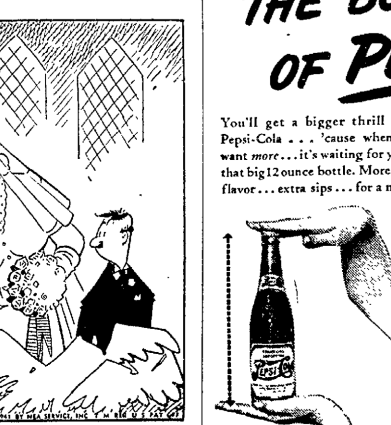
"It was a hard fight, but I won!"