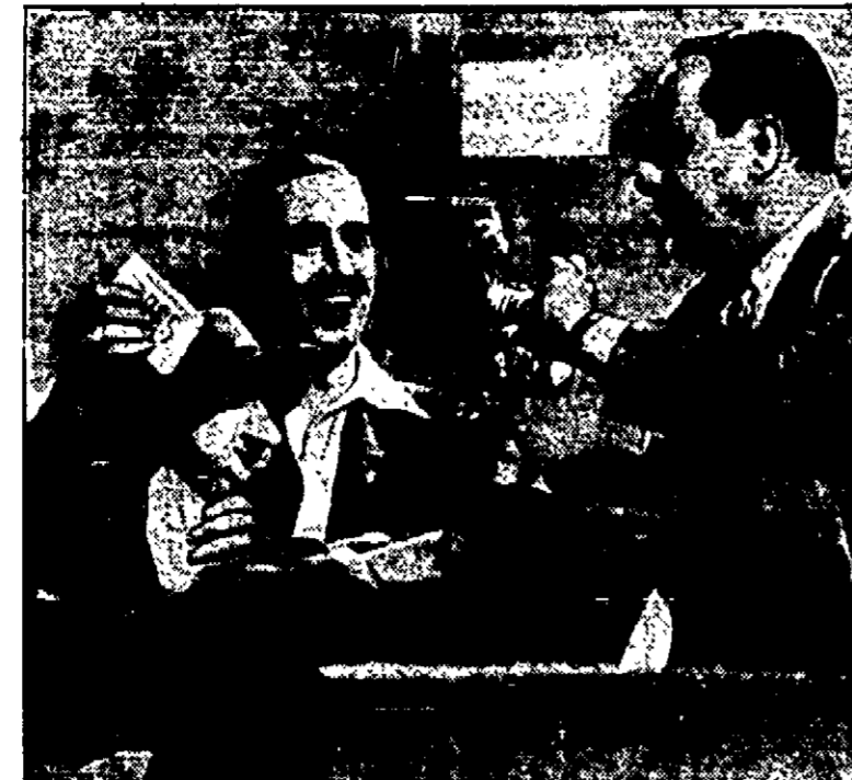
Wall Disney, at left, explains some of the processes of animation to Robert Benchley, right, in the coming Sigma film, "The Reluctant Dragon," which commences Saturday. Both appear in the film which combines live action with animation in a revelation of cartoon comedies.