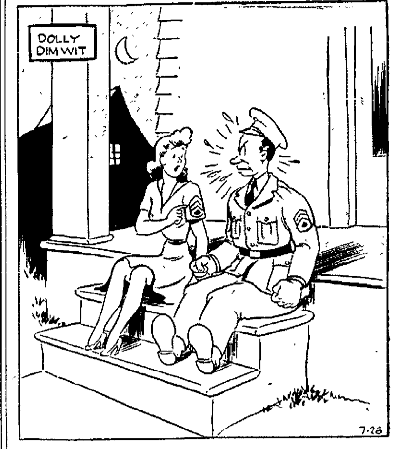
"I don't see why you're so proud of your new sergeant stripes—I bought some just like them for a quarter!"