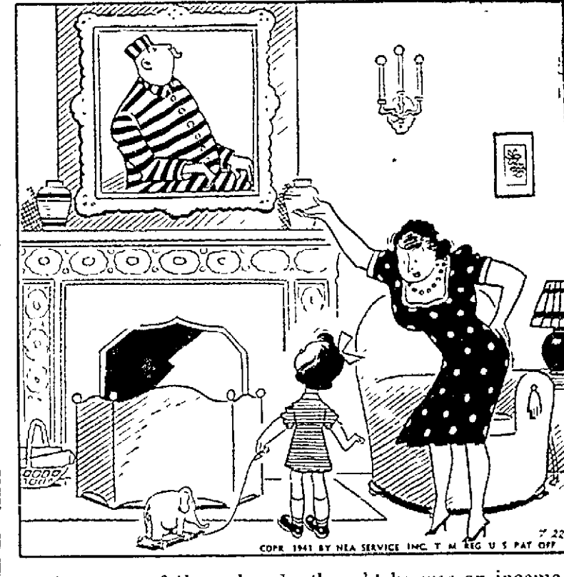
"That's your father when he thought he was an income