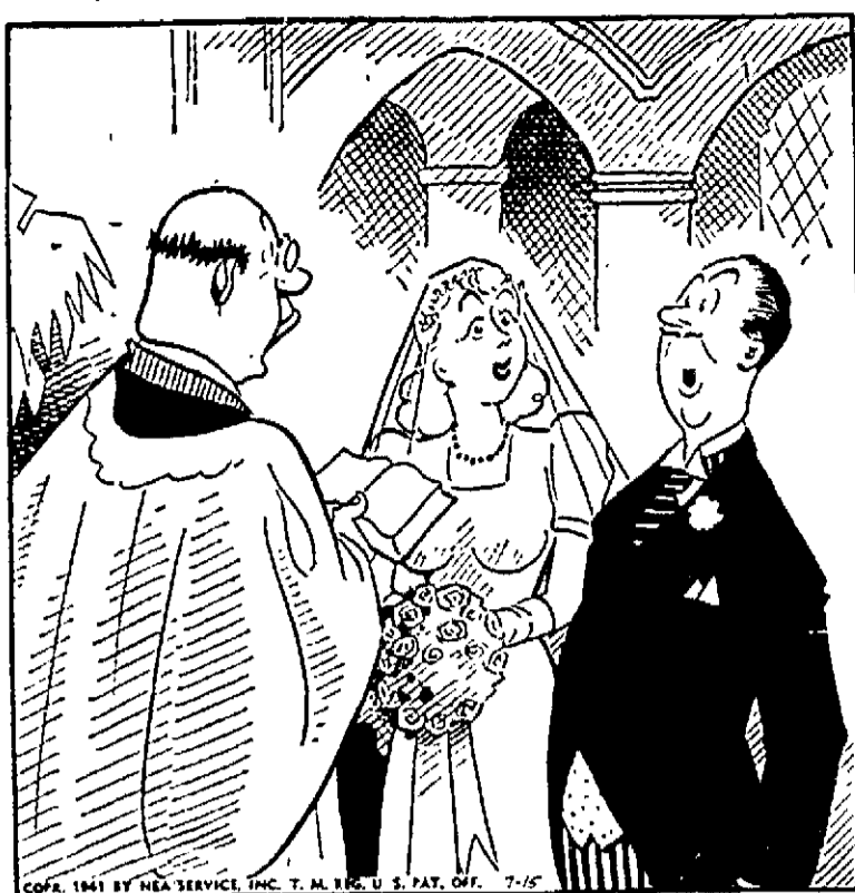
"No ifs, eh?"