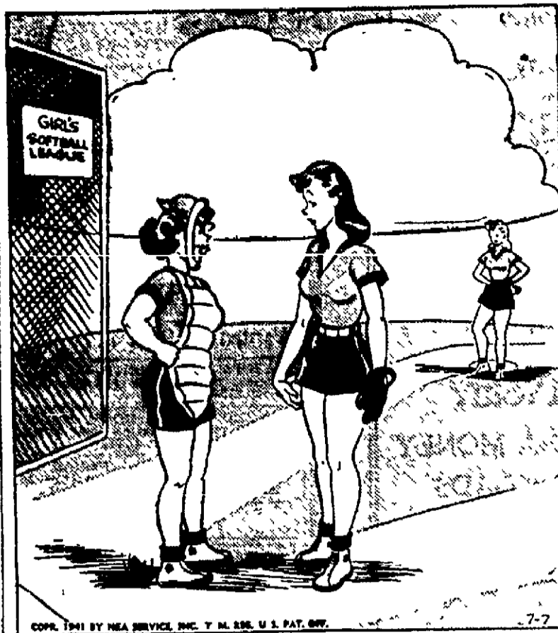
"Now get back in there and show us some curves!"