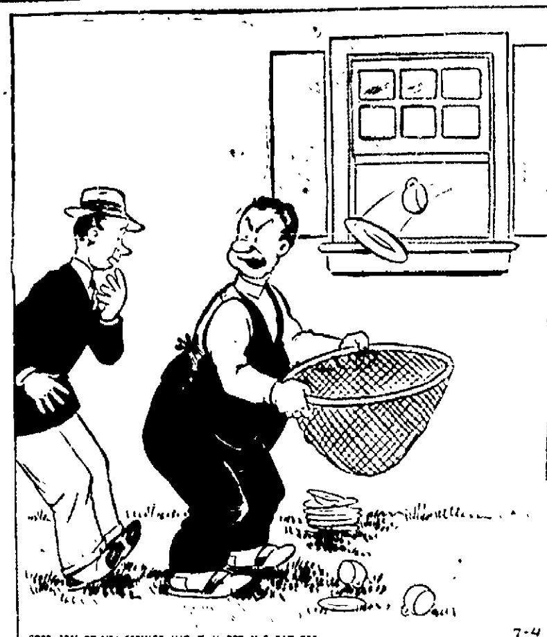
"About once a year my wife gets fed up with washing dishes, and I can't afford to buy new ones!"