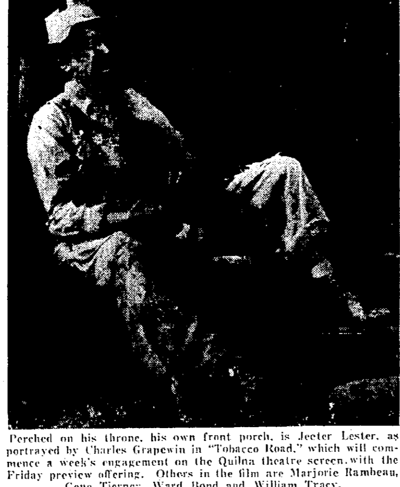
Perched on his throne, his own front porch, is Jeeter Lester, as portrayed by Charles Grapewin in "Tobacco Road," which will commence a week's engagement on the Quilna theatre screen with the Friday preview offering. Others in the film are Marjorie Rameau, Gene Tierney, Ward Bond and William Tracy.