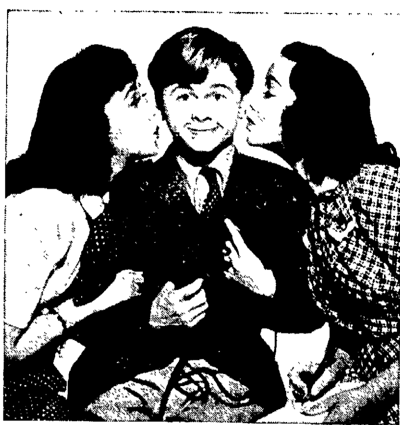
In a dilemma is Mickey Rooney, above, between his best girl, Ann Rutherford and his new office help, in the film, "Andy Hardy's Private Secretary," which commences Friday at the Ohio theatre.