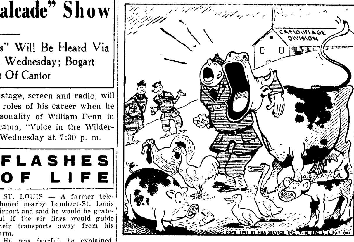
"He's learning barnyard imitations to fool the enemy!"