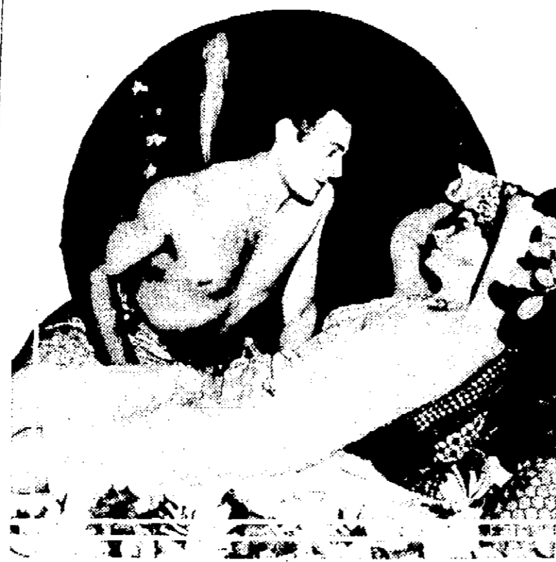
Jon Hall and Frances Farmer are the stars of the Majestic theatre current feature, "South of Pago Pago," the story of love between two natives of a Pacific island.