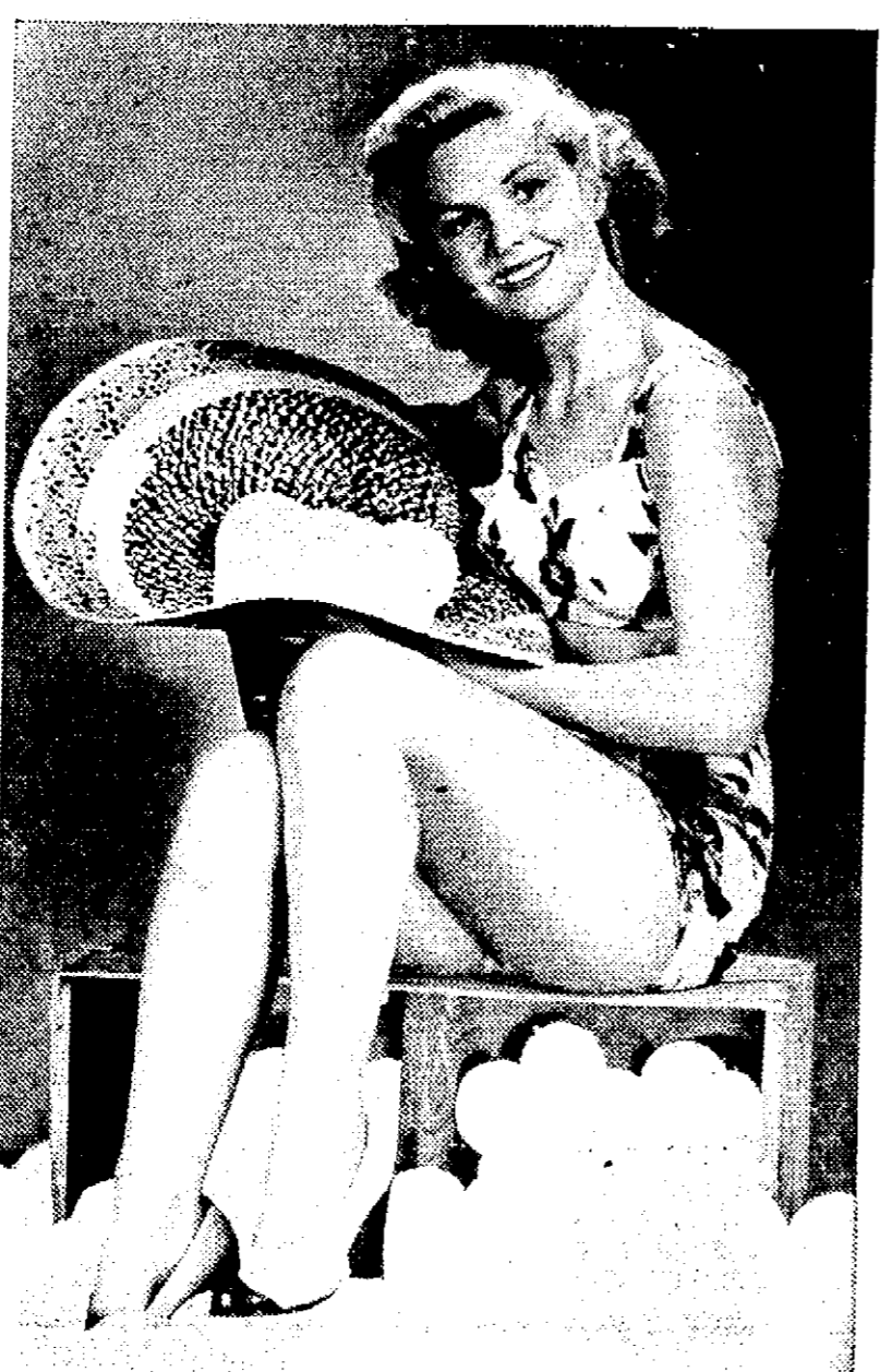
When British picture censors don't want part of a photo to show their just white it out. So, when the picture editor saw this stimulating art and was displeased by the presence of a publicity-seeking little round fruit, he simply said to the picture retoucher: "White out those things and use the girl."