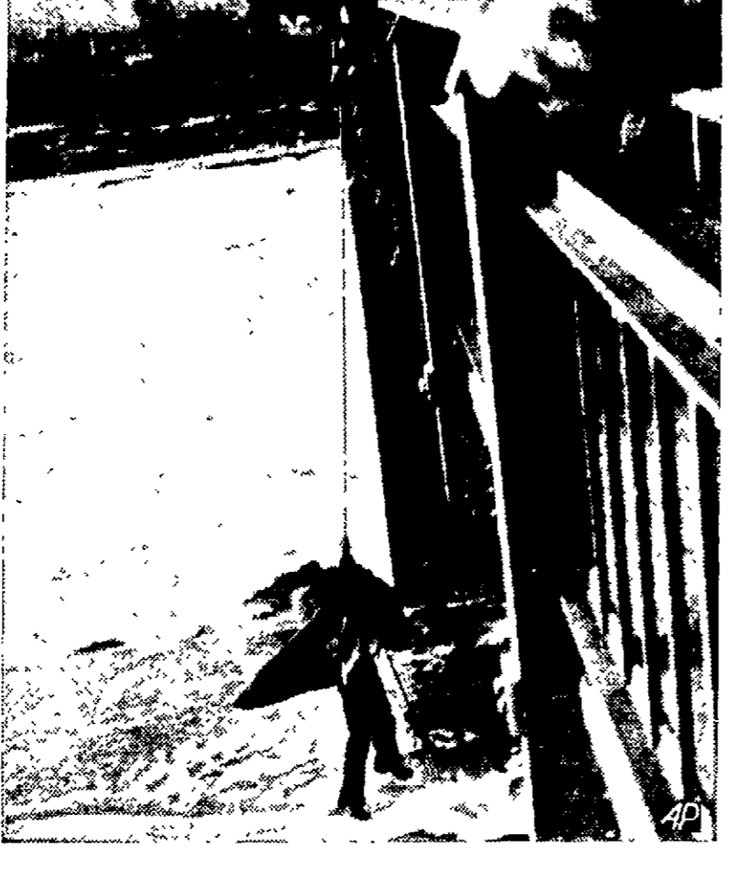
Police saved Horan Hubert Snell, 18, of Muscatine, Ia., from possible drowning after the ice broke as he was walking across the Mississippi river between Rock Island and Davenport, Ia. Rescuers threw him a blanket and safety belt attached to rope line from the top of the Rock Island Centennial bridge and pulled him 65 feet to safety.