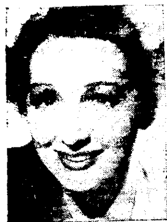
Among fans of Hedda Hopper's Hollywood news-casts over CBS are hosts of film stars who have to keep up to date on the doings of their movieland friends. Miss Hopper is pictured here.

One of the most violent objectors to America's entrance in the World War I will be heard tonight at 8 through WENR and WIBA, when Sen. George W. Norris (Ind., Neb.) takes to the air on "The Lend-Lease Bill" to explain his views on American aid to Britain and her allies.