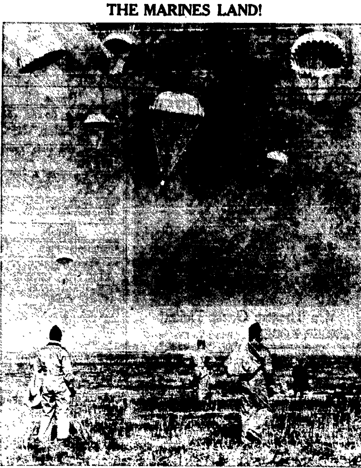
Marines taking parachute jumping lessons at the Lakehurst, N. J., naval air station come down to earth as other 'chutists watch from the ground. Fifty-five marines gave a demonstration of "static-line" parachute jumping from transport planes. In this form of jumping the parachute is attached to the plane by a rope and opens automatically as the 'chutist clears the ship. The men were part of a group of 80 now in training at the station.

MARTIN'S TAVERN 1 1/2 Miles N. on Findlay Road "THE TOPS IN NIGHT SPOTS" FEATURING THE FAMOUS OLGA THE GIRL THAT'S GOT IT! RAGS—The Boy Can Paint And Other All Star Acts! ONE OF THE BIGGEST SHOWS EVER PRESENTED IN LIMA! 8 BIG ACTS — 2 SHOWS NIGHTLY