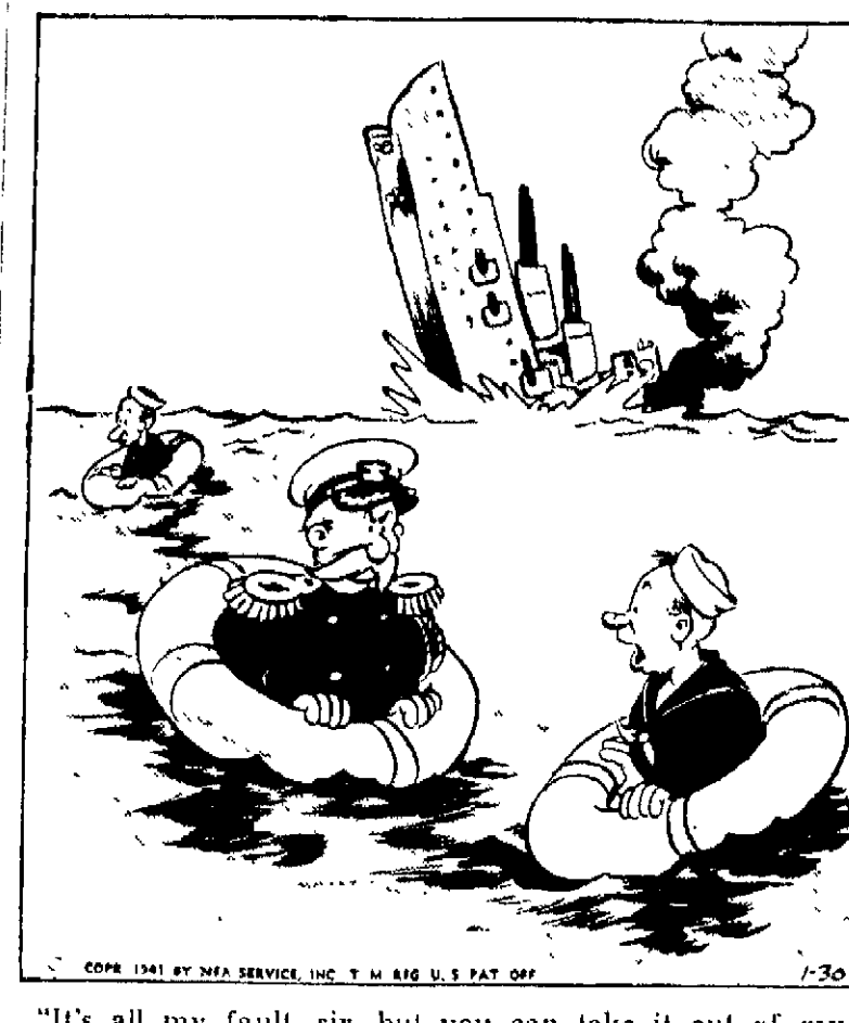
"It's all my fault, sir, but you can take it out of my