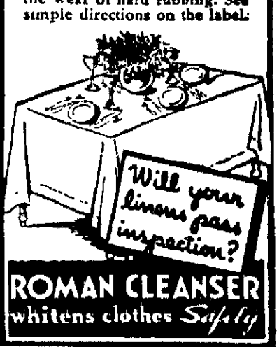
Table linens must be extra nice for holidays, so be sure to wash them with Roman Cleanser; Roman Cleanserremoves mains. makes linens snow-white. Saves the wear of hard rubbing. See simple directions on the label: