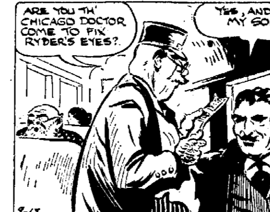
ARE YOU THE CHICAGO DOCTOR COME TO FIX RYDER'S EYES?