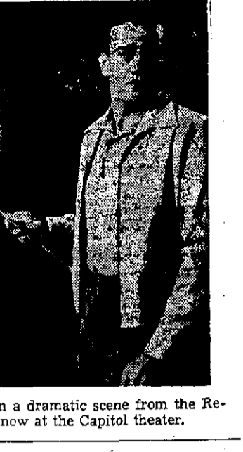
Sammy Baugh in a dramatic scene from the Republic film, "Three Faces West," now at the Capitol theater.

Baugh tossed seven passes in the first period to bring two Washington touchdowns. Sanford converted twice. The All-Stars turned back four Washington rushes from the two-yard line as the second period closed but were unable to stem a third-period scoring march. Zimmerman raced 27 yards to score and Baugh passed to Malone in the end zone to chalk up the other two Redskins touch-