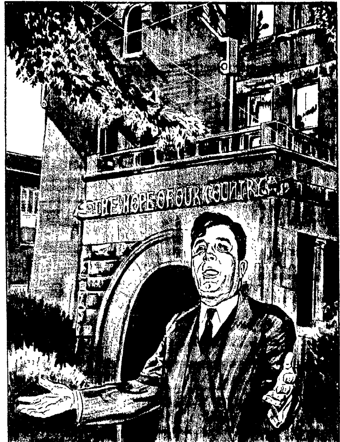
Before Wendell Willkie accepts the Republican nomination for president at Callaway Park on the outskirts of his home town of Elwood, Ind., he'll say hello to old friends from the steps of Elwood high school. Here's the scene sketched in detail, down to the "wrong way" N in "The Hope of Our Country."