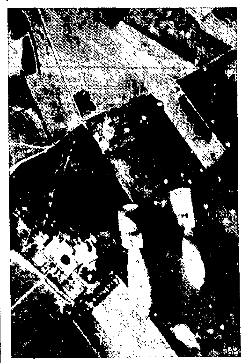
This British caption on this photo says it shows missiles of destruction let loose by the Royal Air Force during a successful raid on Abbeville, France, now held by the Germans.