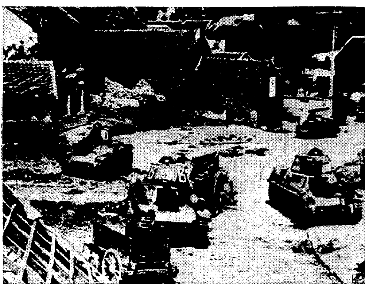
These are French and Belgian tanks, according to the German censor-approved caption, in an unnamed village on the Western front after the Nazis had entered the town.