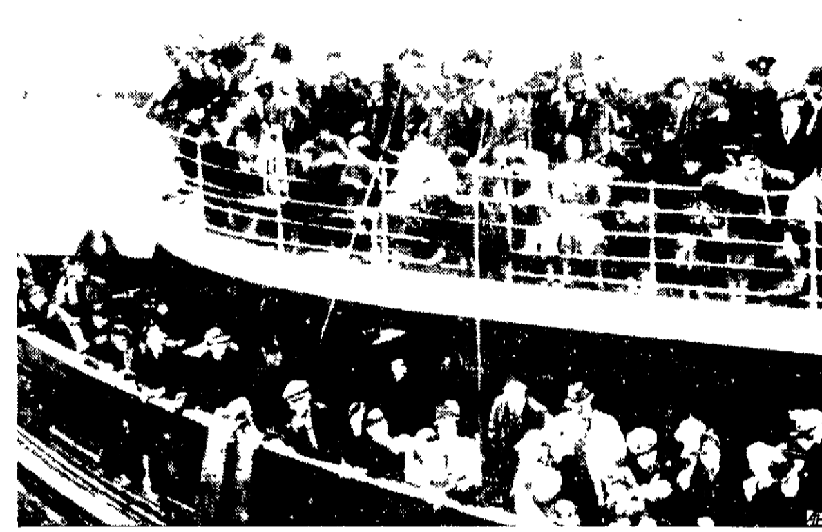
This picture cabled from London to New York, shows American refugees aboard a tender at Galway, Ireland leaving to board the United States liner President Roosevelt anchored a mile off shore. The liner made a special trip to pick up more than 800 Americans who wished to leave the expanding European war zone.