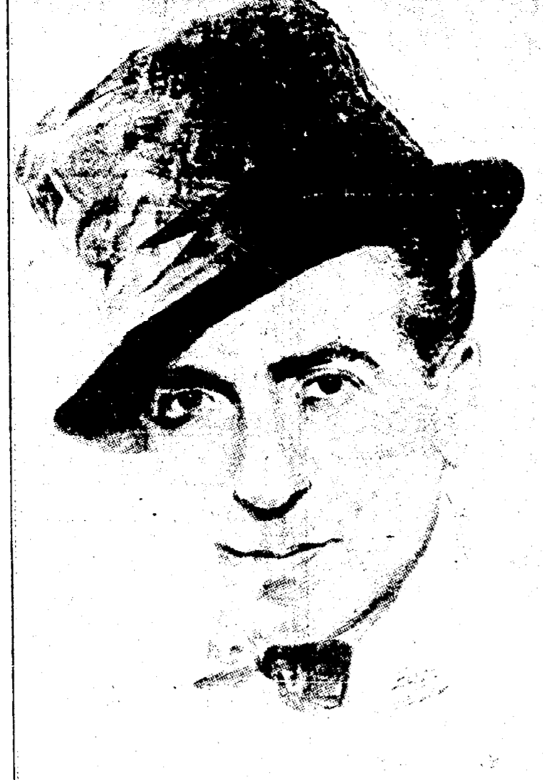
The old familiar "Is everybody happy?" of Ted Lewis, top-hatted band leader of universal fame, will be heard again when the maestro brings his orchestra and "Happiness Revue" to the Ohio theatre Saturday for a one-day stand.